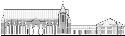
Conceptual elevation design drawing.