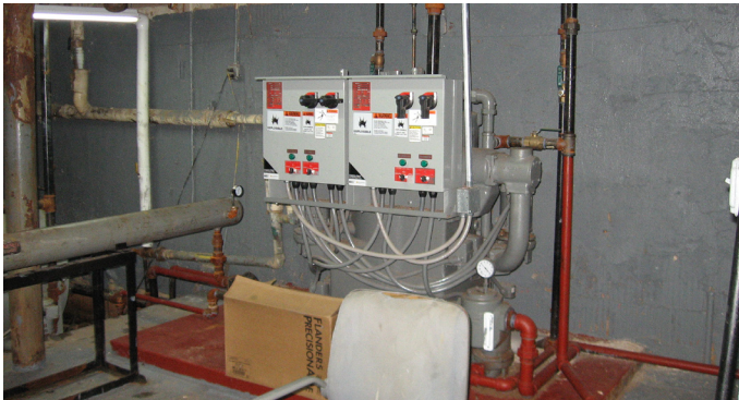
View of the existing vacuum pump unit in the mechanical room adjacent to the main boiler room.