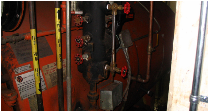
New low-water fuel cut off (non-mercury type).