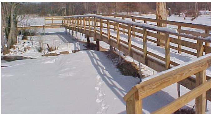
A view of the completed boardwalk in the snow at the Black Creek Crossing.