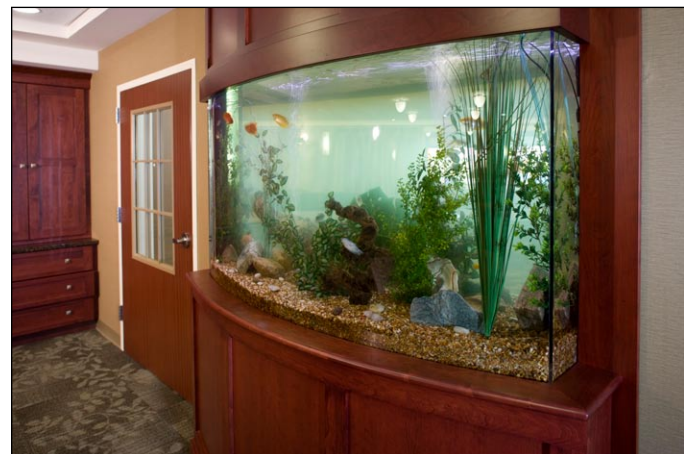
Built-in Fish Tank