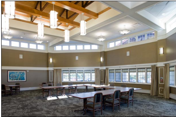
Great Room Interior